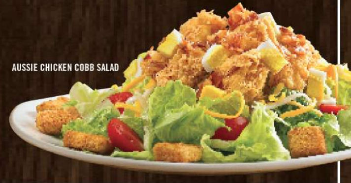
AUSSIE CHICKEN COBB SALAD

Spinach, cucumbers, carrots, and sun-dried tomatoes tossed in mustard vinaigrette and topped with crispy shrimp, tomatoes, red onions, and our spicy sriracha aioli sauce. QR 56