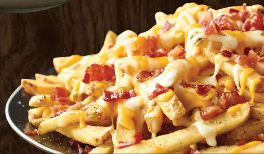
AUSSIE CHEESE FRIES