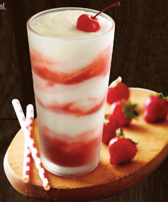
COCO BERRY SMOOTHIE

Premium ice cream blended with your choice of strawberry, vanilla, chocolate and topped with whipped cream. 360ml. QR 30