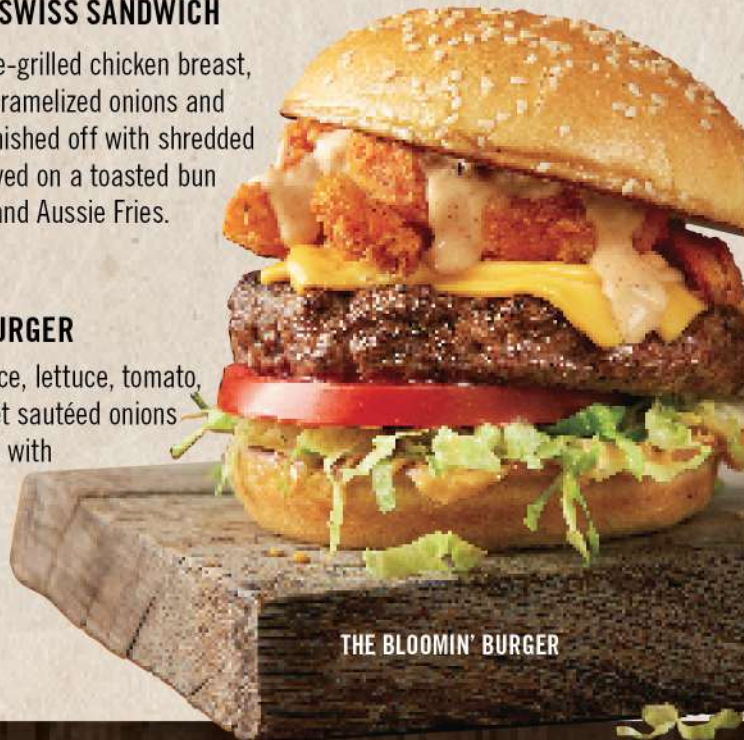
THE BLOOMIN' BURGER

Seared and sliced steak with BBQ sauce, mixed cheese, lemon aioli and our famous Bloomin' Onion petals on a toasted Bushman Bread. Served with Aussie Fries. QR 56