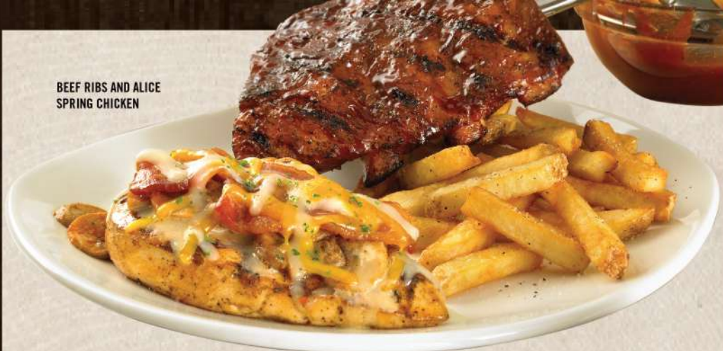
BEEF RIBS AND ALICE SPRING CHICKEN