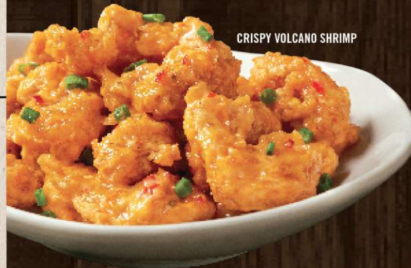
CRISPY VOLCANO SHRIMP