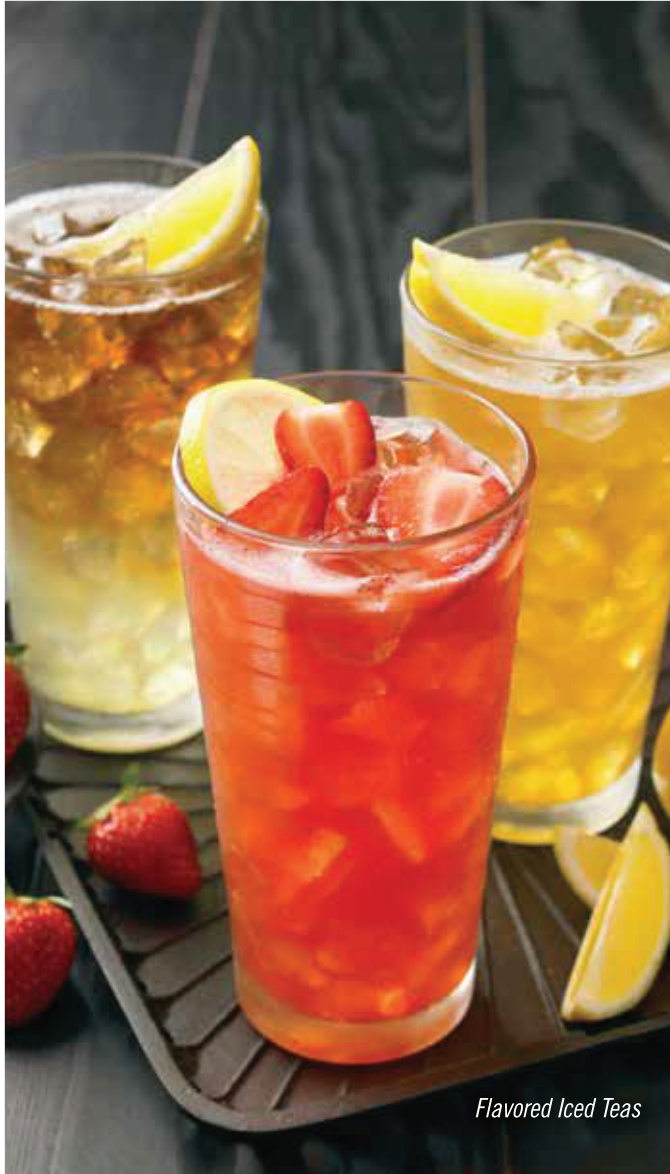
Flavored Iced Teas