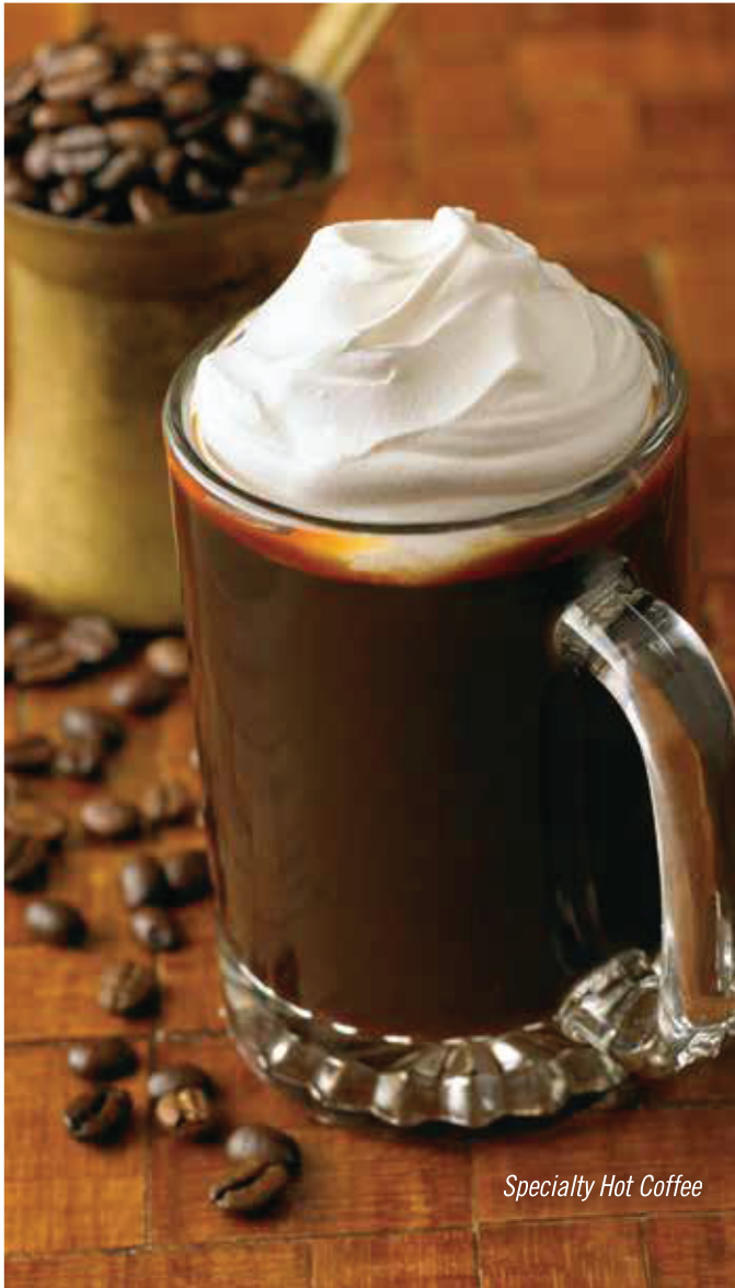
Specialty Hot Coffee