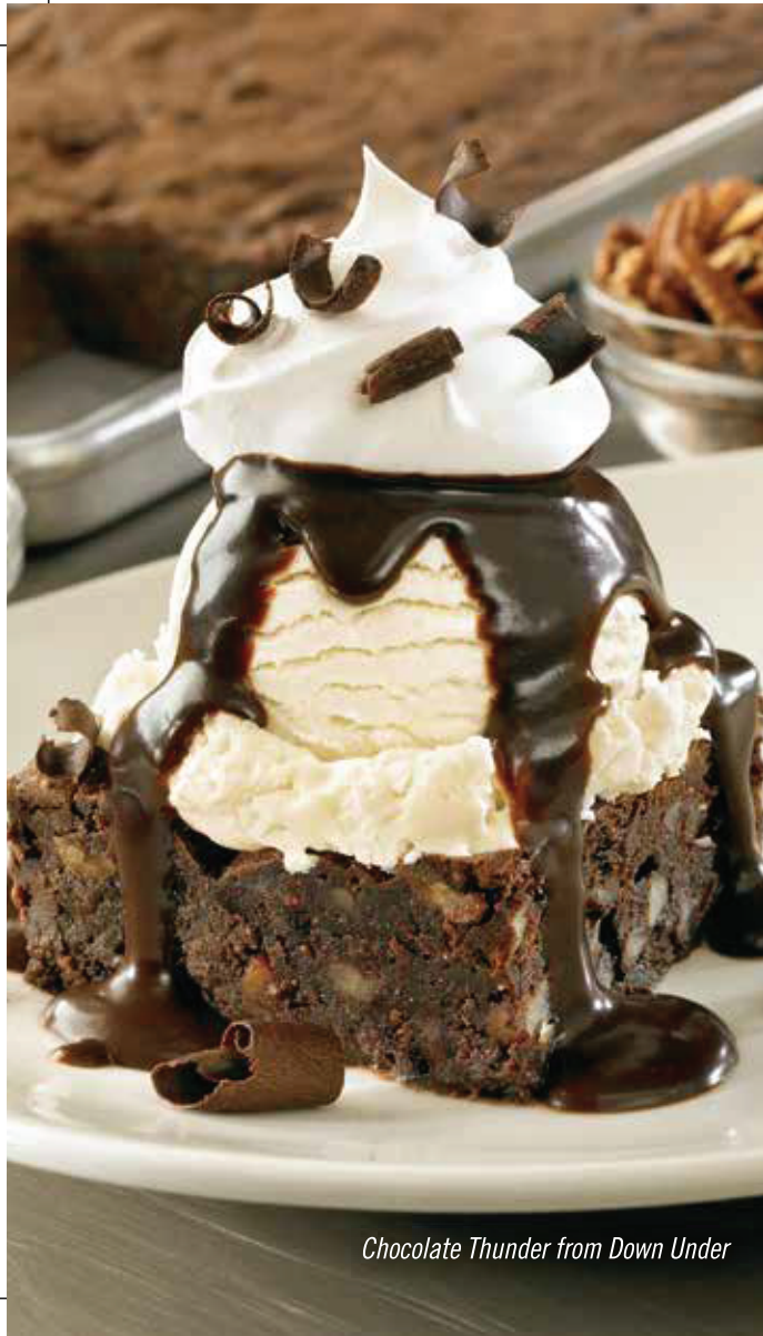
Chocolate Thunder from Down Under