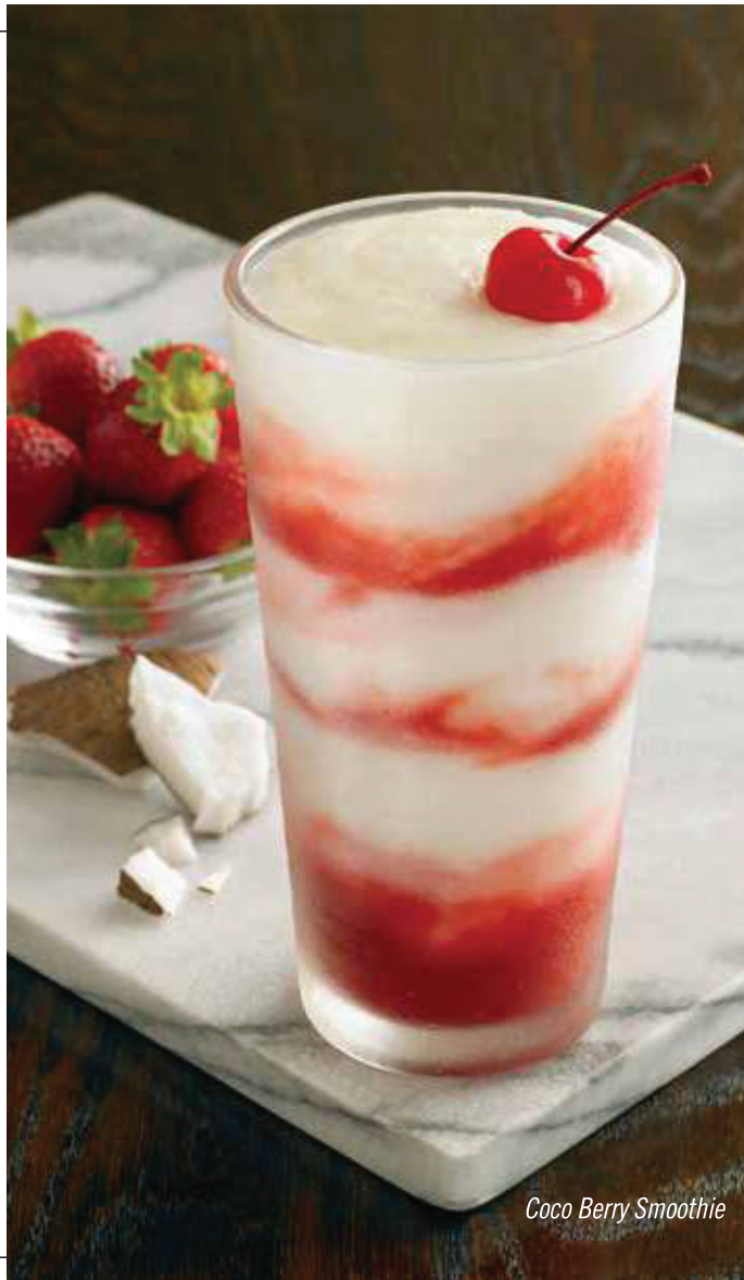
Coco Berry Smoothie