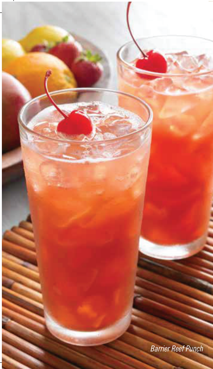
Barrier Reef Punch